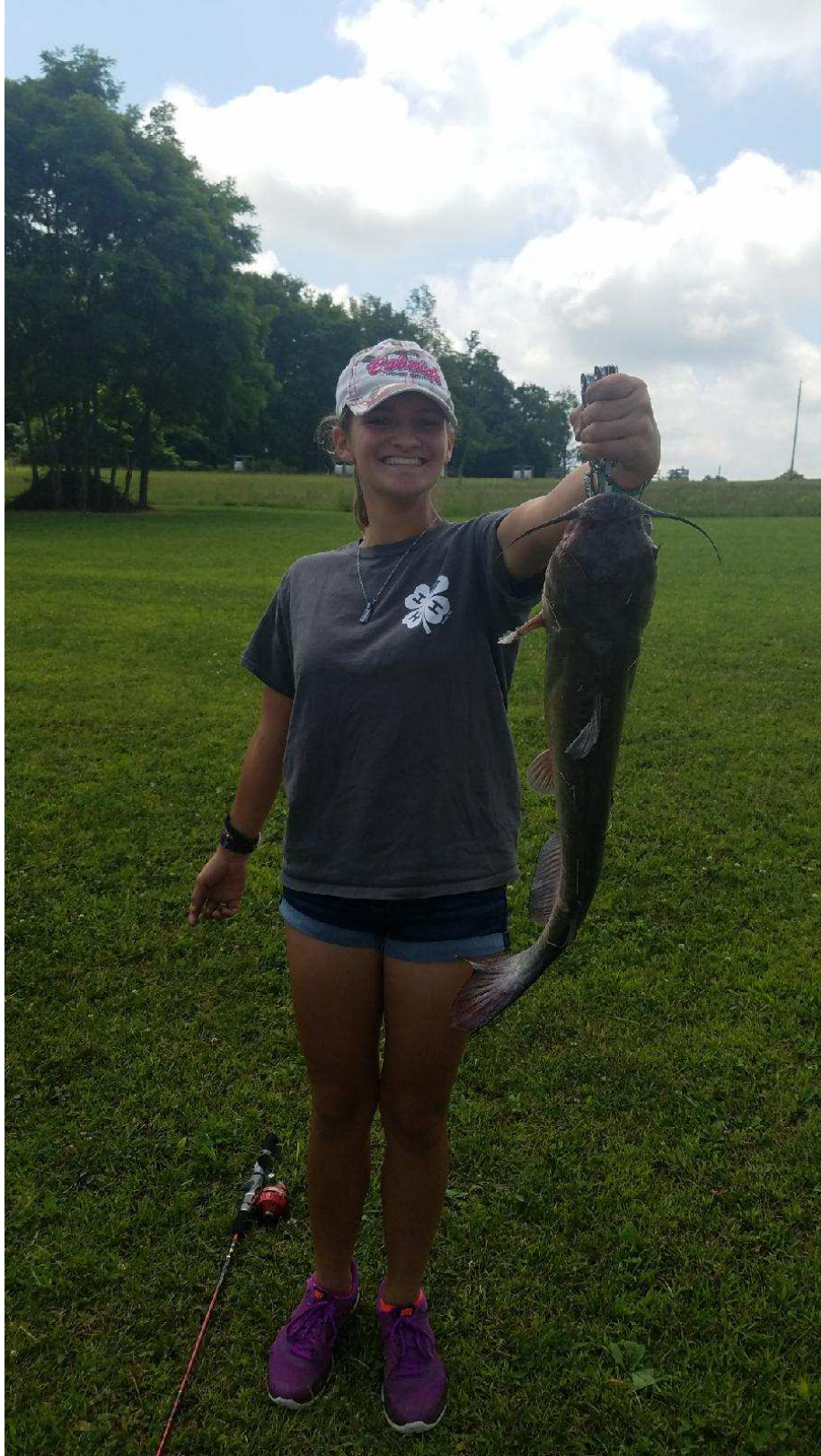
Fish Fest 2017—Biggest Fish!!!