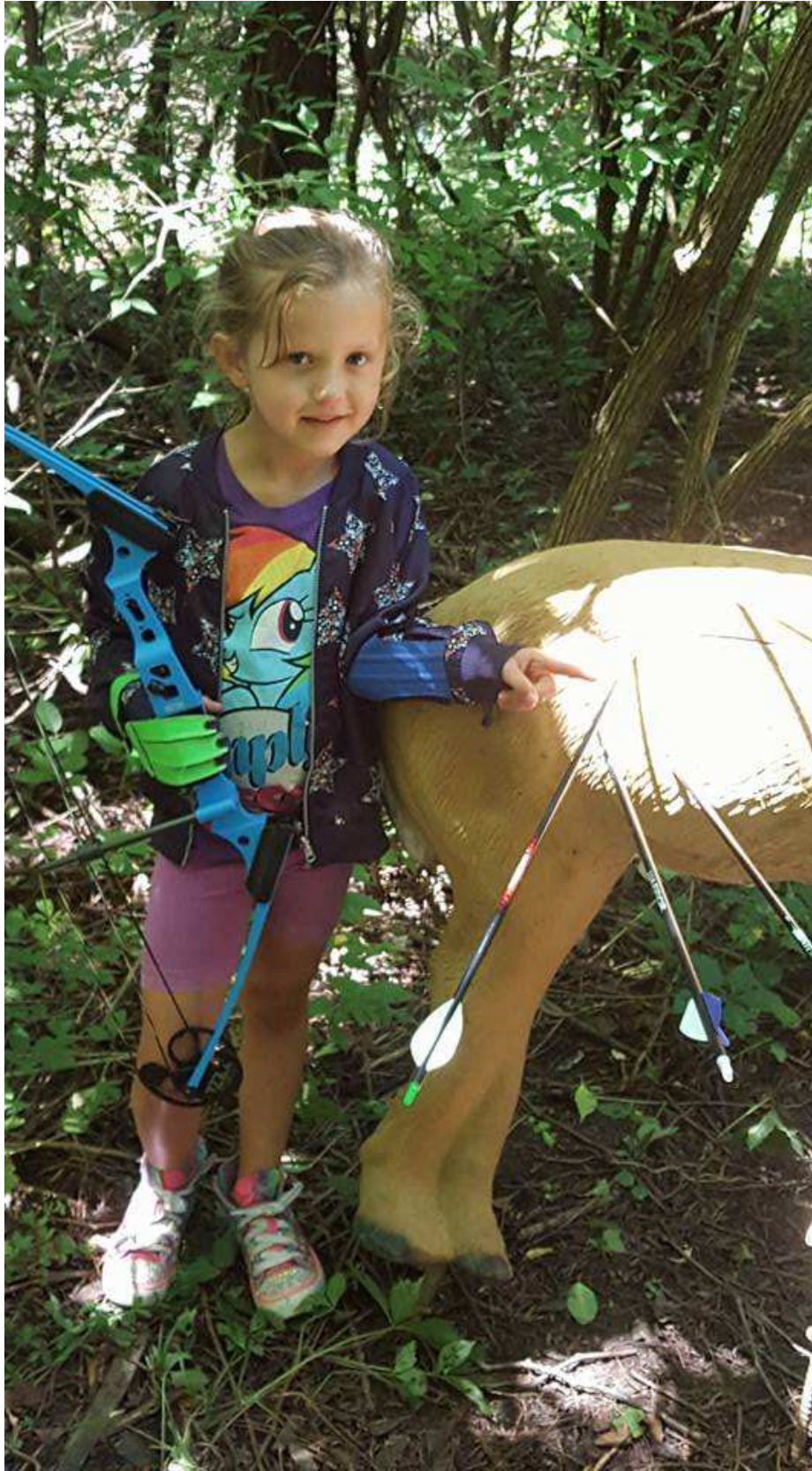
Introducing the next generation to Archery!!