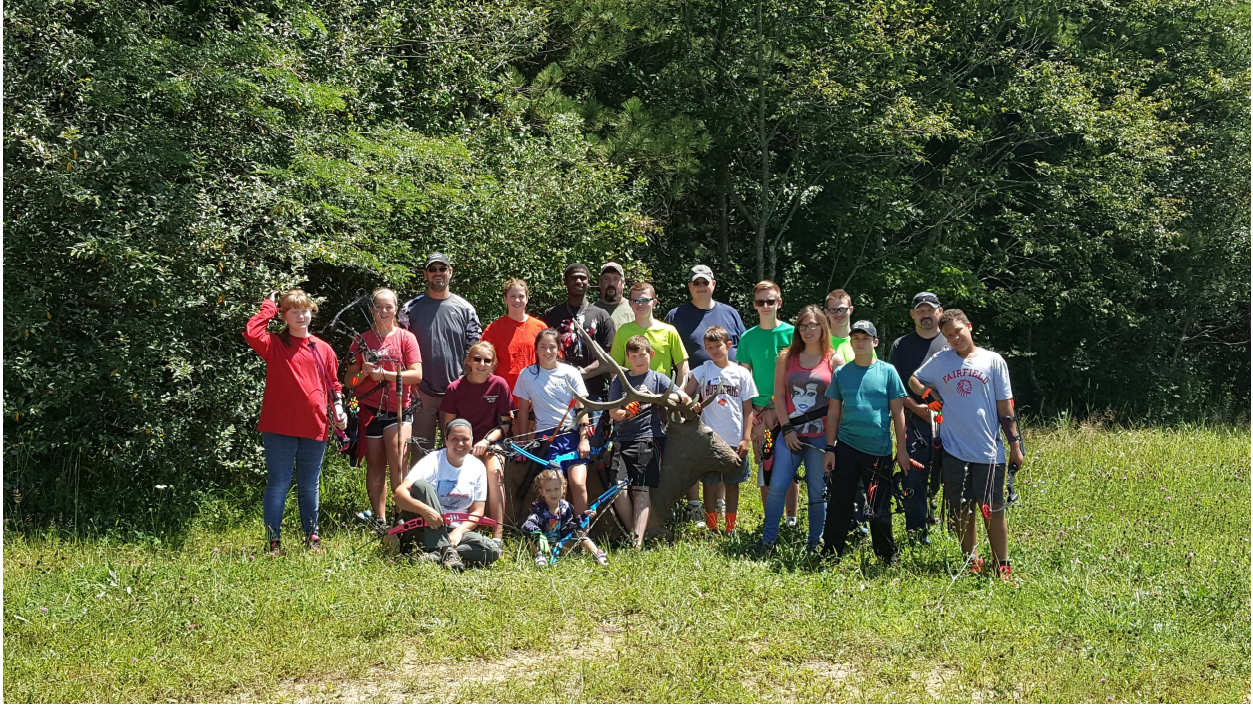
Group photo 2017 Archers in the outdoors

Always check the online calendar for the latest scheduling information!