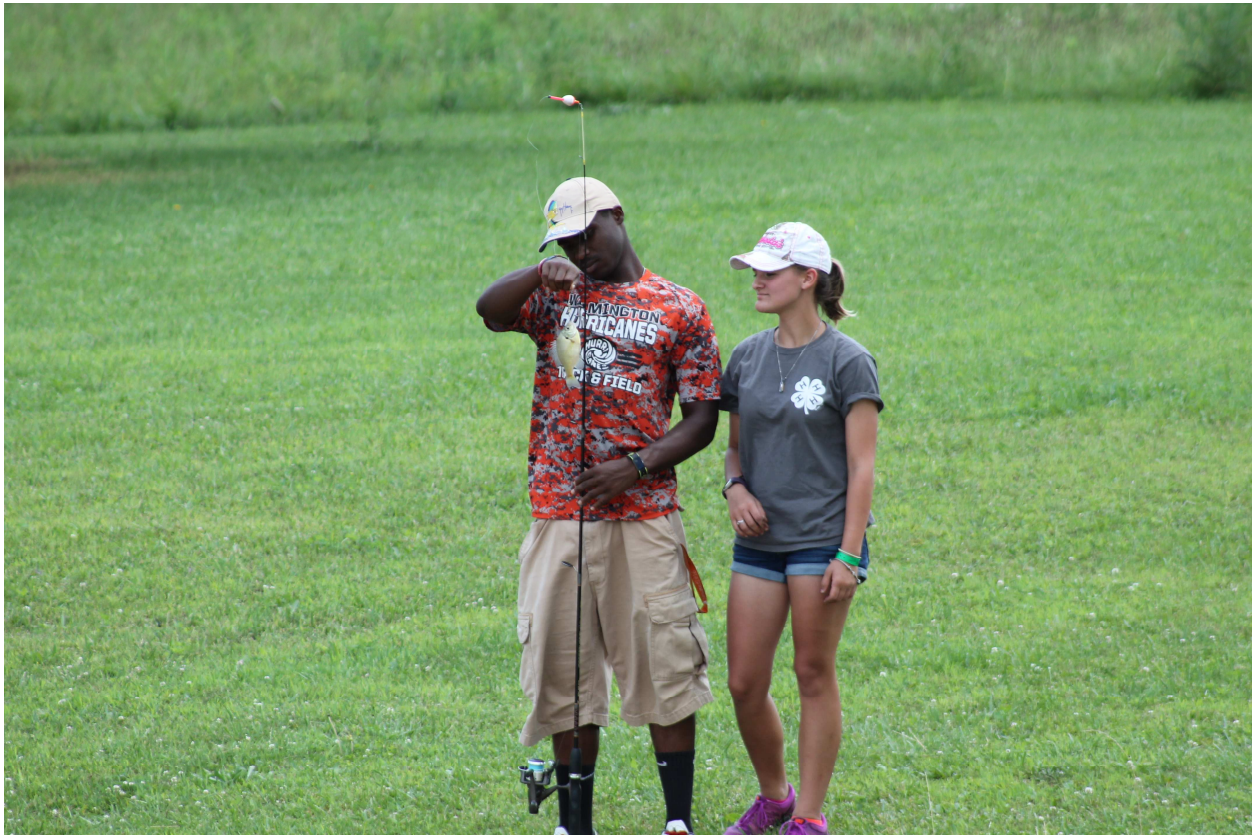
Fish Fest 2017—smallest fish.