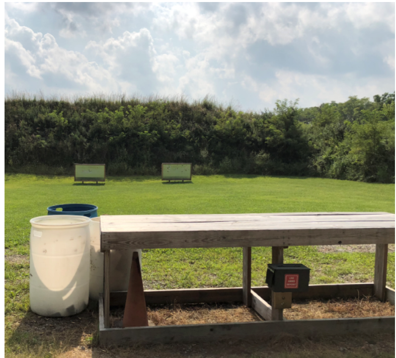
Live/Dud ammo can shown on Bay 4