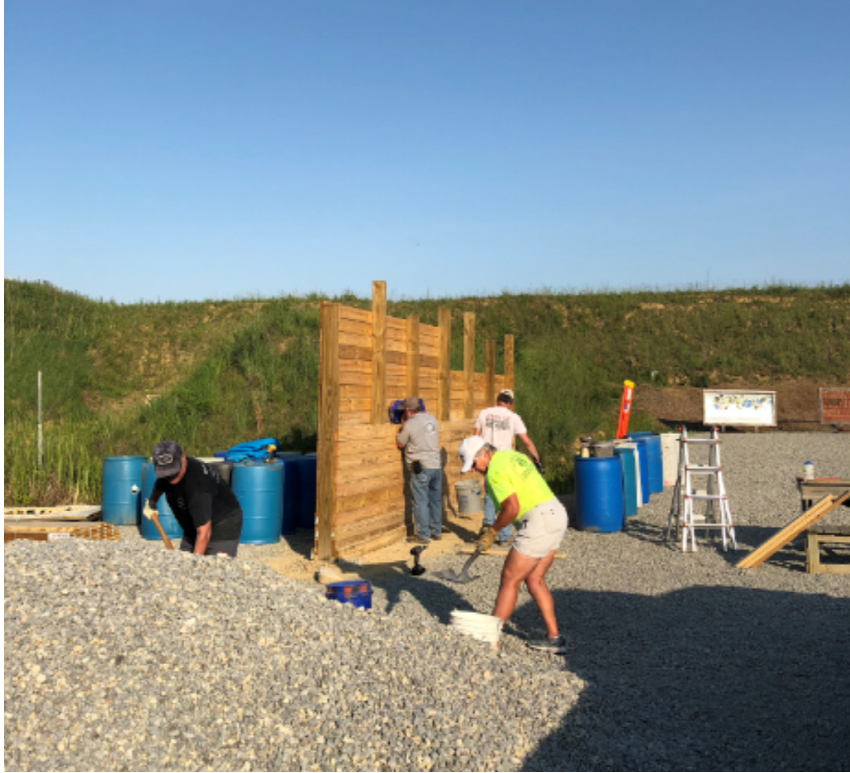
Volunteers working on the Bay 5/6 barrier