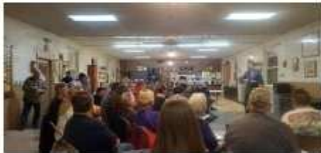
U.S. LawShield Seminar

February looks promising with two events. Our normal meeting will focus on "Refuse to be a victim" focusing on situational awareness, online safety, avoidance techniques and understanding the psychology of the criminal mindset. Our second event will be a first aid class with emphasis on gunshot wounds. We are looking forward to both events and a busy year ahead!