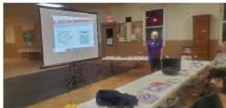
Refuse to be a victim